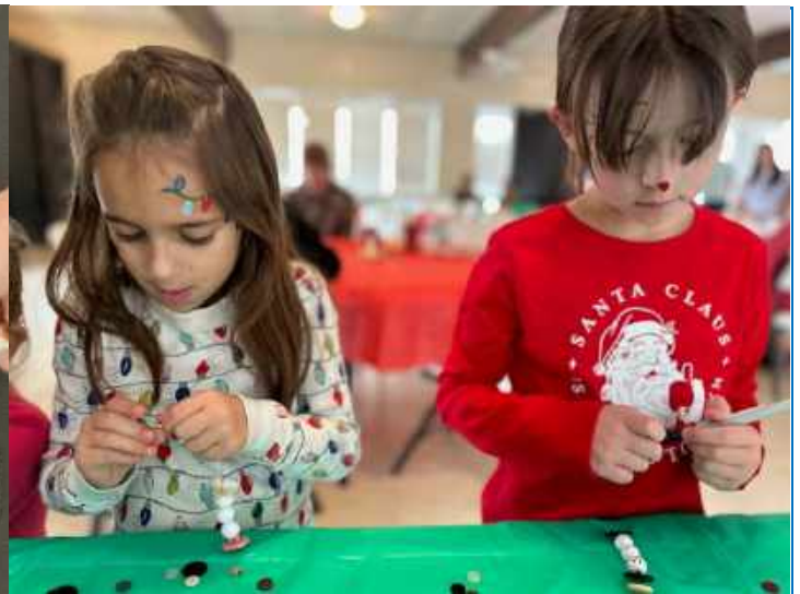
The Mayas work diligently on snowmen ornament.