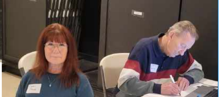
Residents representing 18 lots attended the January 23rd Annual Meeting