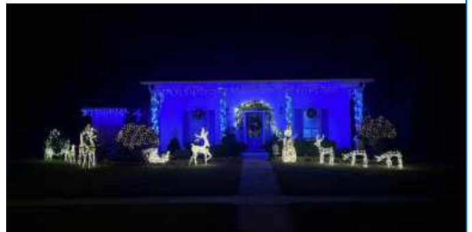
James Jefferson III 12224 Lake Sherwood Ave South