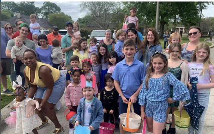
Group of Lake Sherwood residents eagerly waiting for the start of the Easter Egg Hunt