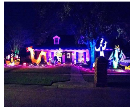
Judges favorite-Lake Sherwood East

However, the rate of readership has increased with the new format allowing better viewing on the cell phones. A sample of the output for the recent Security Report is below. As you can see we can track the resident by email as to the time and date the email was opened.