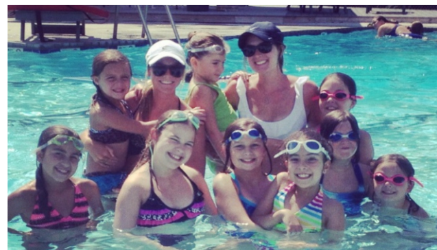
Junior Swim Team and coaches